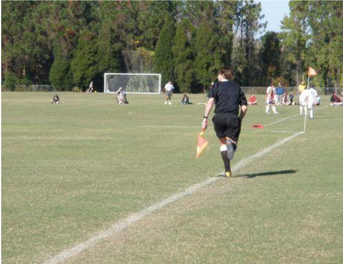
Running the side line with flag towards the field.