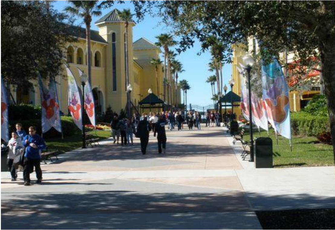
Disney Wide World of Sports complex Orlando, Florida.