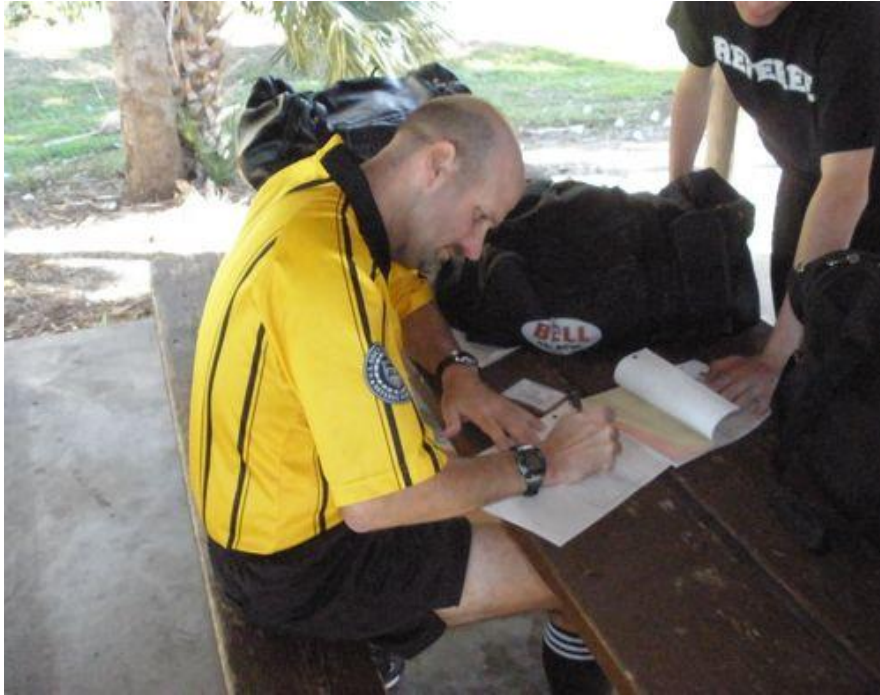
Writing up the Reports after the Game