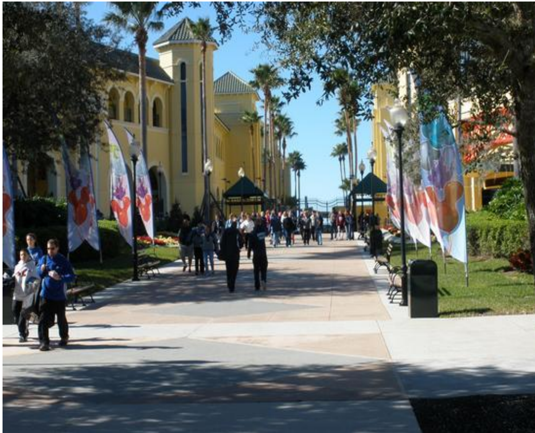
Disney Wide World of Sports entrance.