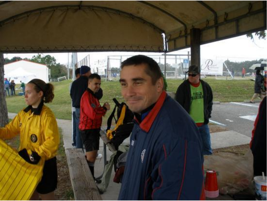
State of Massachusetts Referee Crew.