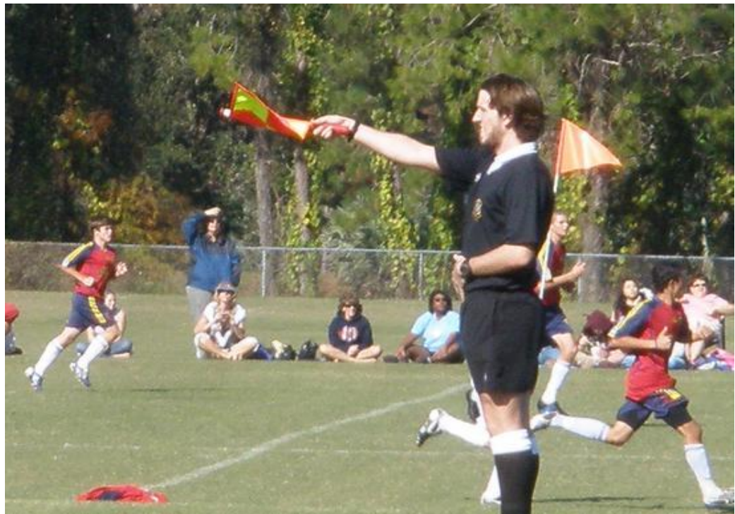
Assistant Referee offside signal middle of the field.