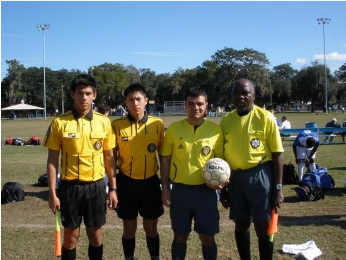
Tampa Bay Sun Bowl Boys u16 Final Referee Crew

The levels of competition at the two tournaments that I was involved in were comparable in skill level to that of Ontario Cup and most instances are higher. Players at this tournament had better ball skills, but less physical presence. This might be due to the fact that this tournament is used as a recruiting ground for college and university coaches in United States.