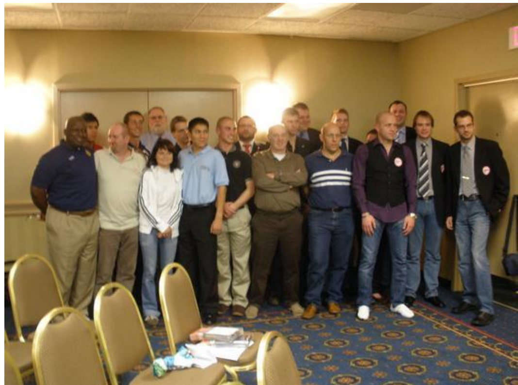
The European Referee Crew with couple of Referees from United States to the left.