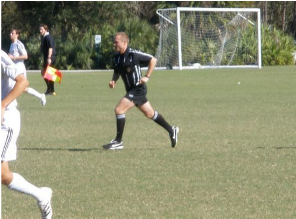
Keeping up with the play at the tournaments.