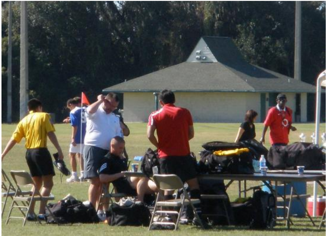
Relaxing between games in Tampa.