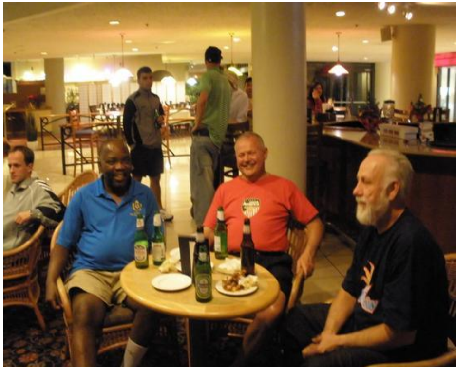
Relaxing with other referees after a long day.