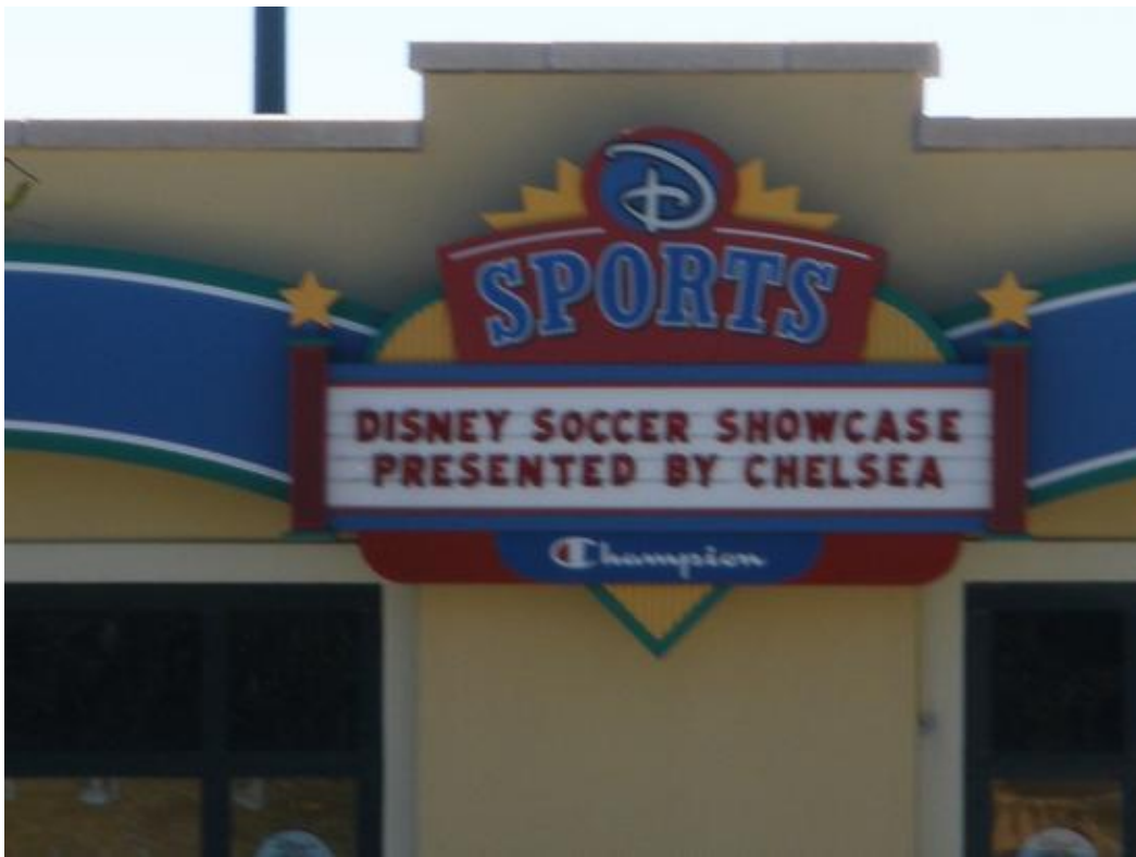
Disney Soccer Showcase.