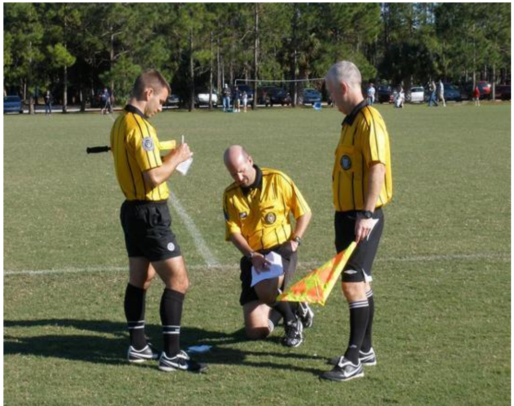
After the Game - Taking care of the game report.