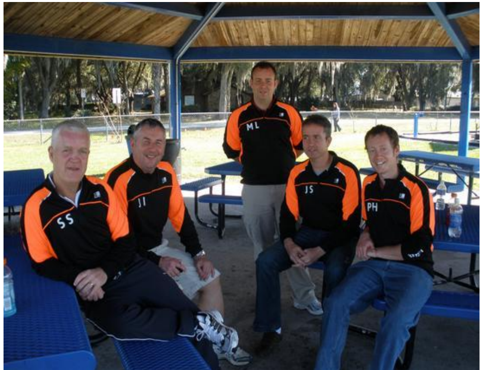
United Kingdom Referee Crew.